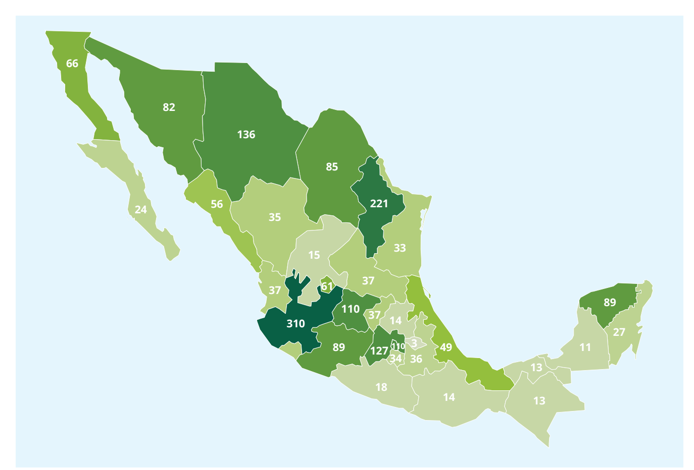
Figure 3. Distributed generation capacity in Mexico per state (MW) (2021).

Support policies that foster the installation of DG in and by households, small businesses, and local cooperatives are key to the just transition. DG contributes to a just transition by generating benefits for the local community; it allows communities to generate their own energy, reduce their dependence on the centralized power grid, and reduce both local pollution and greenhouse gas emissions.